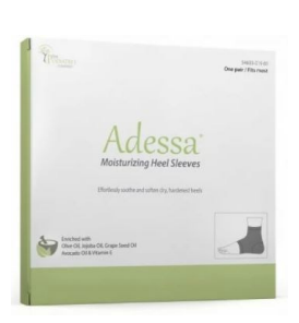
Adessa Gel Sleeves

Staying Safe and Warm: Your Winter Home Guide—4